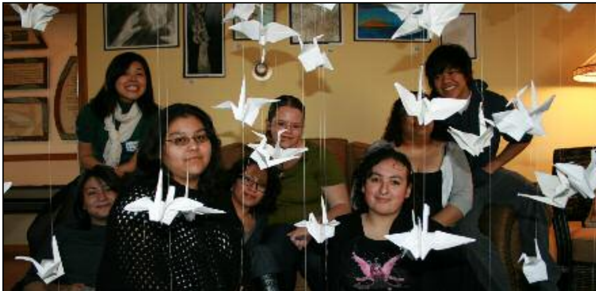
Zacharias Center's Youth Allies C.A.R.E. members selling their pieces at the Art Exhibit Auction during our Open House event.