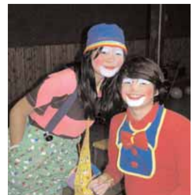
These kids aren't clowning around when they raise money for Zacharias Sexual Abuse Center's kids' programs.

Youth Allies C.A.R.E. (Creating a Rape-Free Environment) is committed to increasing awareness of Zacharias Sexual Abuse Center's programs, services and the issues of sexual violence, at their schools, with friends and family, and in doing solicitation with vendors and the community. The committee did a phenomenal job and the event was a huge success, raising $1,415.00!