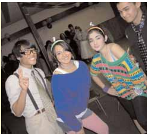
Everyone had a great time at the Youth Allies C.A.R.E. event at Bertrand Bowling in Waukegan.

Great prizes were awarded including a Gap gift card, a Zune, a CD player, Blockbuster gift cards, and Marcus Theatre gift cards.